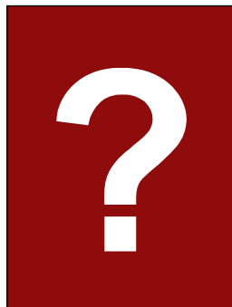
Who will YOU bring?