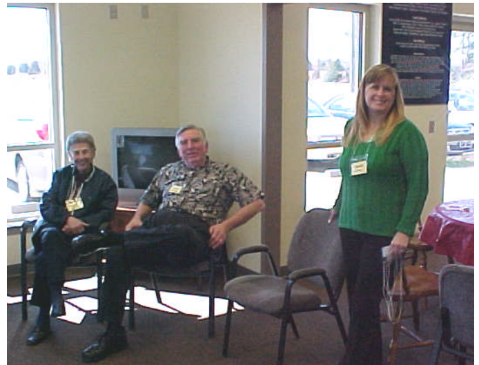
Counselors Prepare for the Seminar

The seminar provides spiritual and practical input. Individual sessions with the husbands