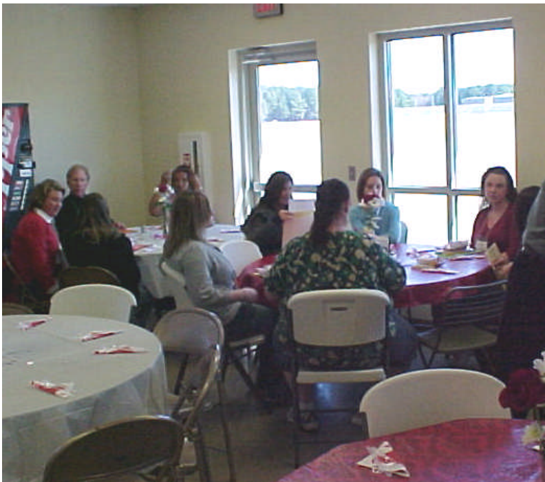
Wives assemble at the Visitation Center prior to the seminar

helped acquaint them with the challenges faced by wives supporting families as single parents. Wives were informed of the challenges faced by their husbands every day inside the prison.