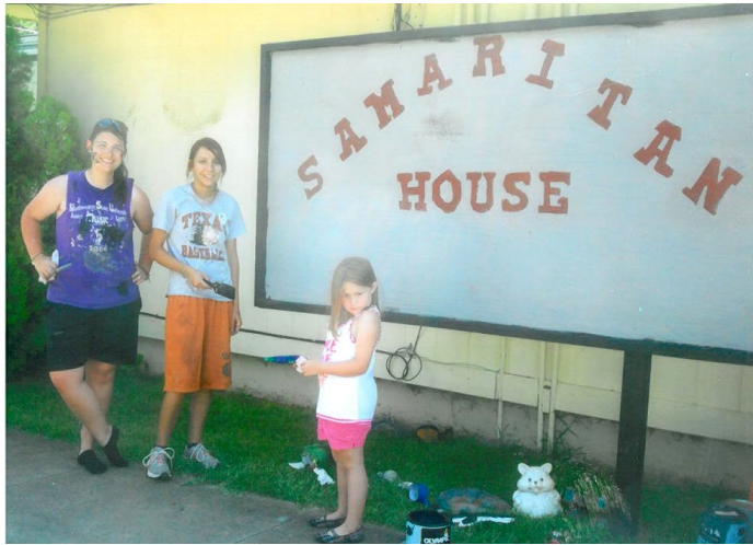
UM Army workers and a helper paint the sign at the overnight stay center.

Volunteers Needed!! Call Edna Walker at 903-276-2193