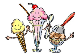
Ice Cream Social

June 23: Ice Cream Social in the Fellowship Hall at 6:00 pm. Plan to bring a freezer of your favorite ice cream!