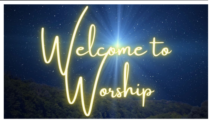
December 3, 2023

\ \ \ \ e are glad you made the VV choice to be here at New Boston's First Baptist Church today. Our prayer for you is to experience God's grace in such an amazing way you'll talk about it all week. In fact, helping others discover how to love God and love people is why we are here! Let us know how we can help you on your journey.