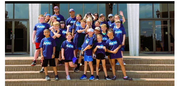
Centrikid Camp June 17—21, 2024 Austin College—Sherman TX