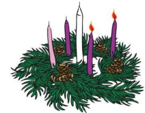
Second Sunday of Advent

CHURCH CHRISTMAS BANQUET - If you plan to attend the dinner on Wednesday, December 18th, please sign up in the vestibule with your name and the number in your family, or contact the church office. There will be 8 seated to a table.